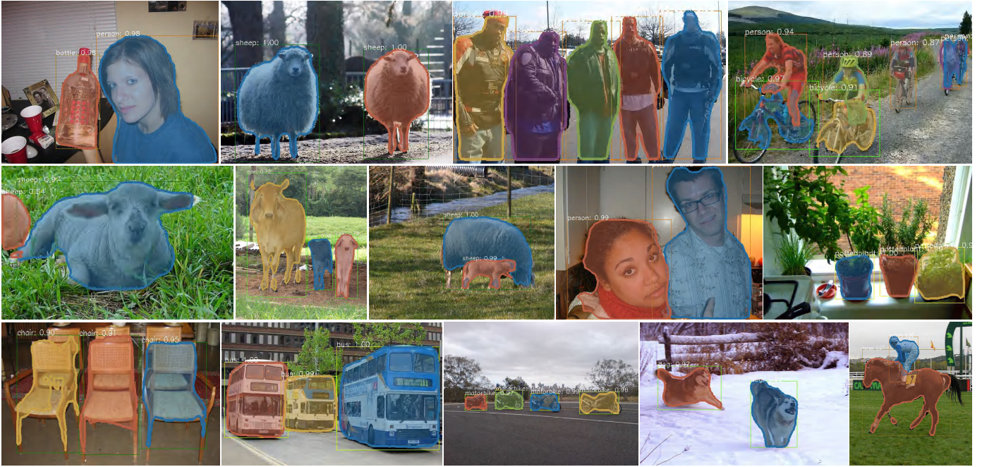
Fig. 3. Qualitative results of instance segmentation on the PASCAL VOC2012 segmentation val set [36].