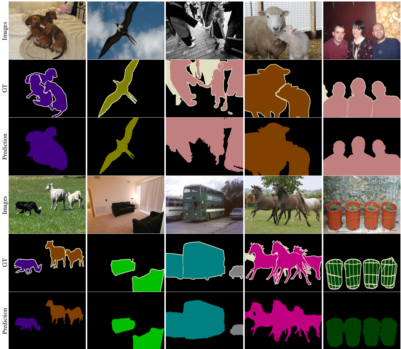
Fig. 4. Qualitative results of semantic segmentation on the PASCAL VOC2012 segmentation val set [36]. From Top to Bottom: Original images, ground truth, and the predicted results by LIID, repeated by the bottom three rows.

Combined with the experiments in Section 6.3 and Section 6.4, we can come to the conclusion that LIID achieves the state-of-the-art performance for both weakly supervised instance segmentation and semantic segmentation.